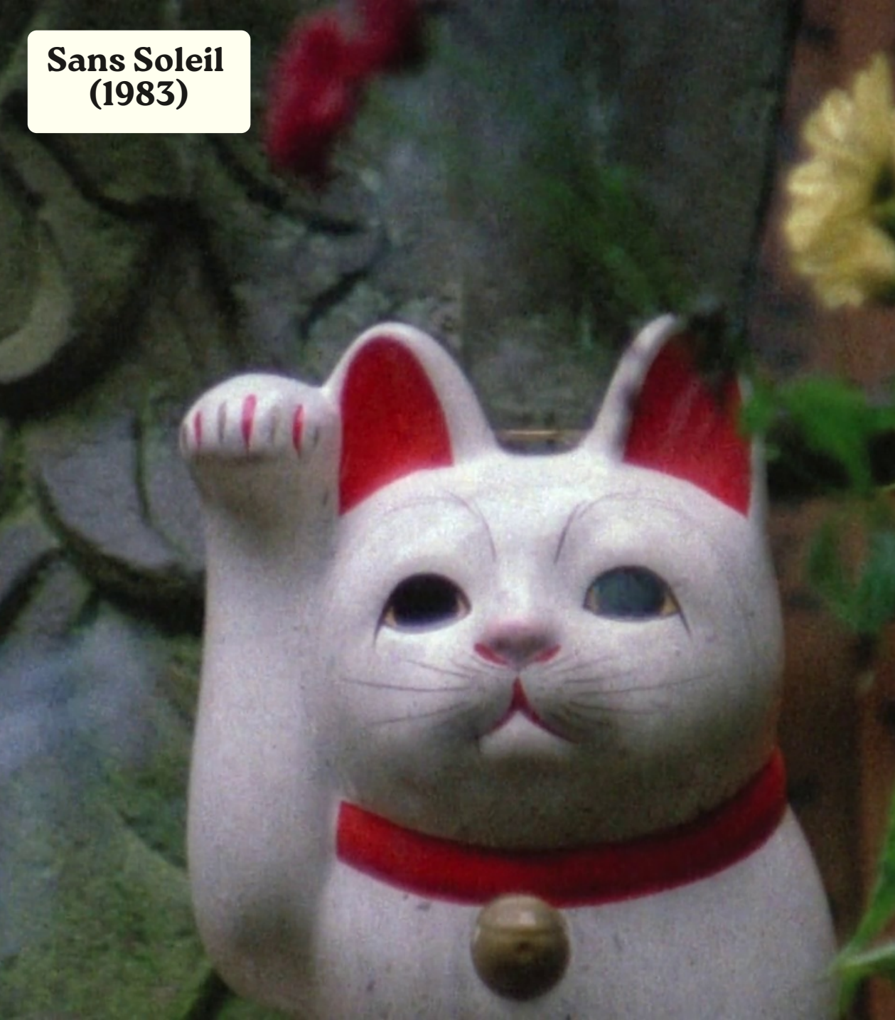
Sans Soleil (1983)